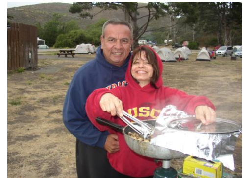
Some Happy Campers!

The Introduction pamphlet is now available in Spanish, and 12 Steps with Scriptures and Working the Steps translations will be available soon. We now have 11 revised and 5 new pamphlets to help groups get the message out to those still suffering. An “update kit” of 4 each (total of 60) is available for a donation of $10. More than 20% of the Central Office operating costs were funded by literature sales last year.