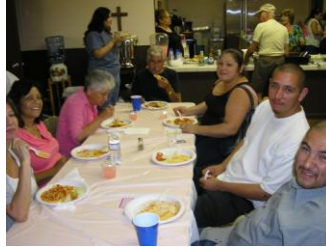
Dinner and Fellowship

Some of the groups in and near the San Fernando Valley gathered for a night of fellowship and a spaghetti dinner, followed by a guest speaker meeting.