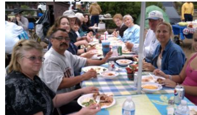
Last year’s group

August 3 rd -5 th , Morro Bay State Park, Morro Bay, CA. Registration includes campsite for Friday and Saturday nights, plus Barbeque dinner Saturday night. All speaker meetings, talks, and workshops are free to everyone. We have sites reserved to accommodate 32 campers, and we have sold out every year, so register early. Sites are for tent camping and have restrooms and showers. We have space for up to 4 RV’s or trailers. For more details, call us toll-free (800)310-3001 and come camping with us!